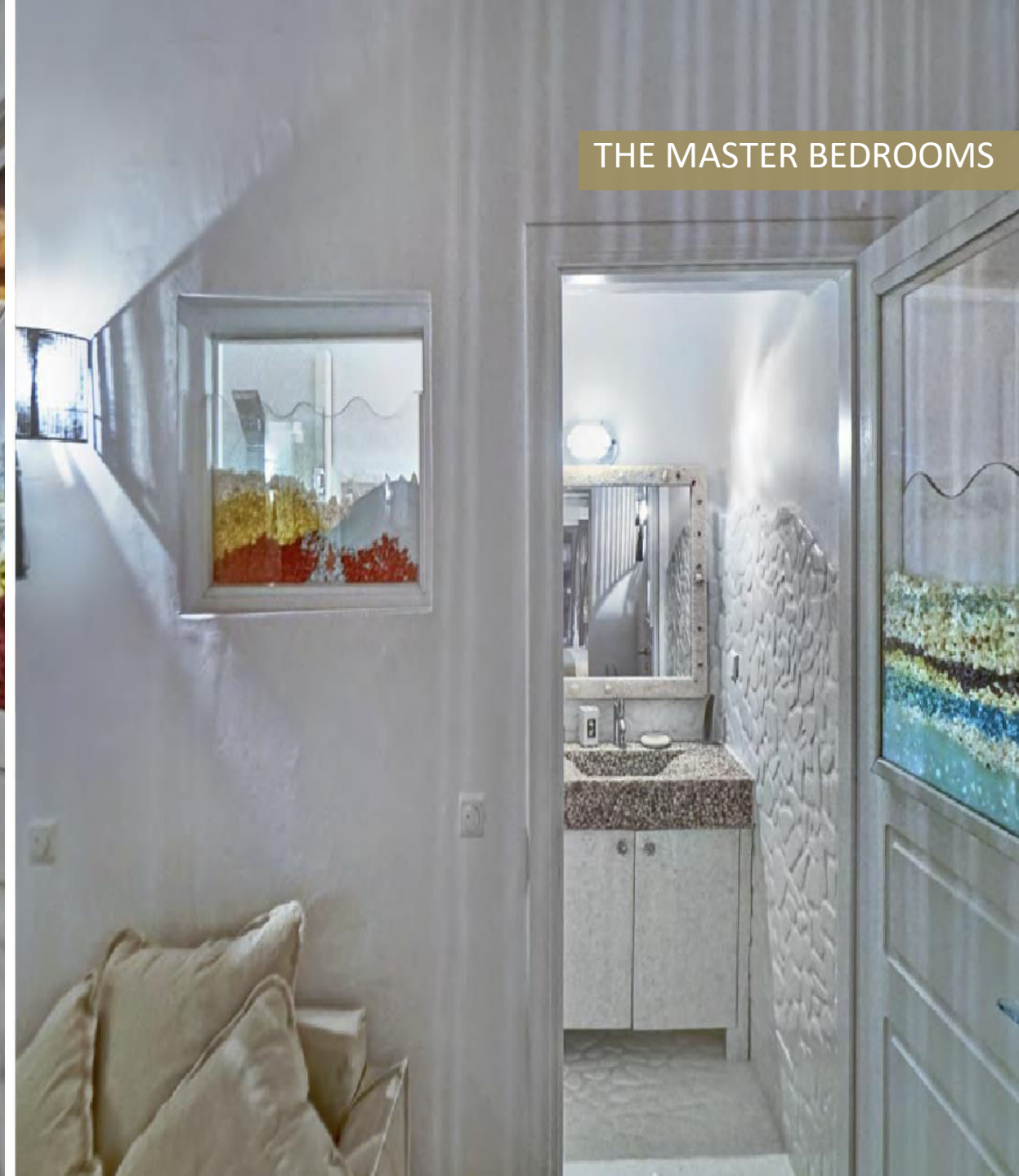
THE MASTER BEDROOMS