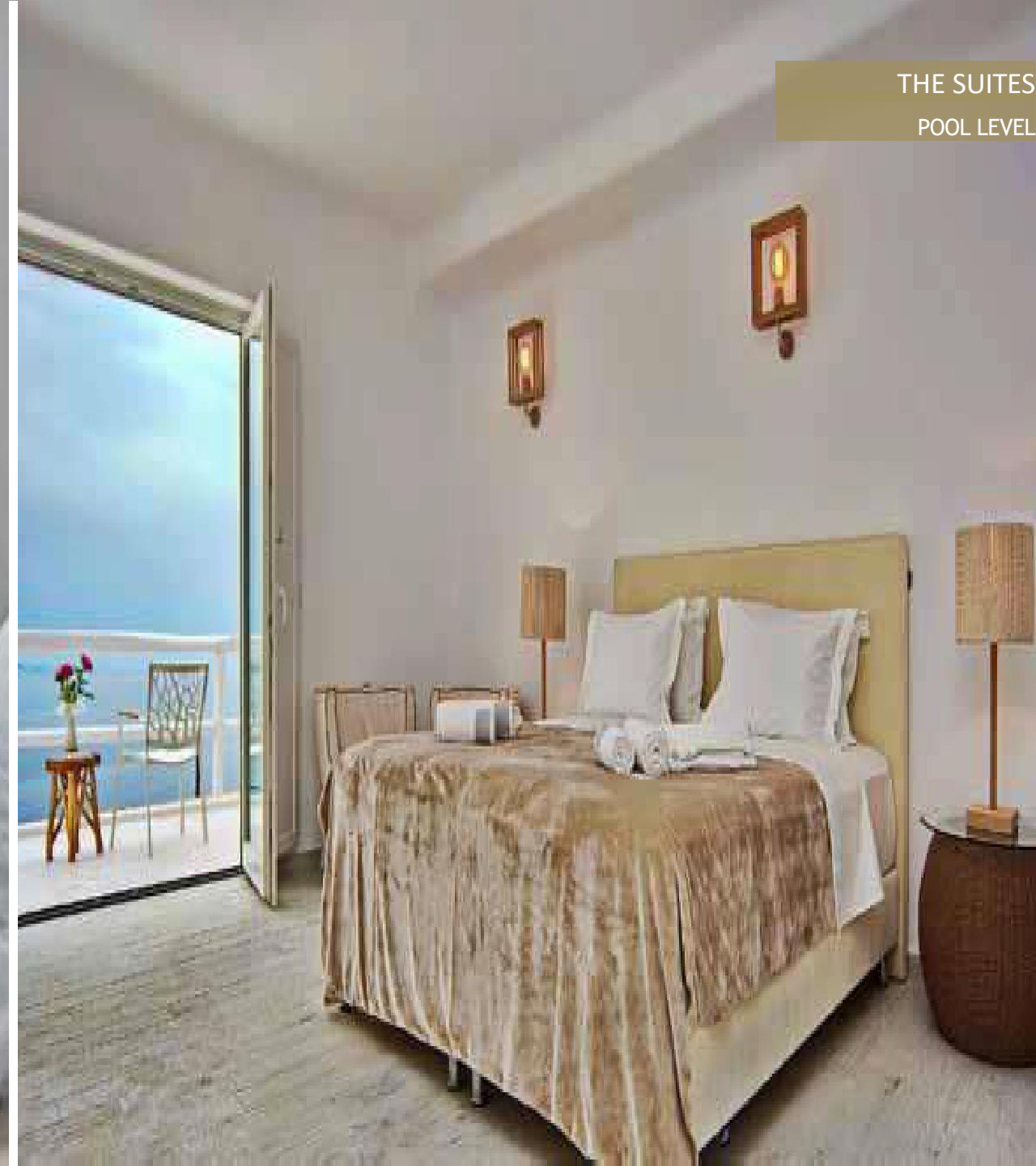
THE SUITES POOL LEVEL