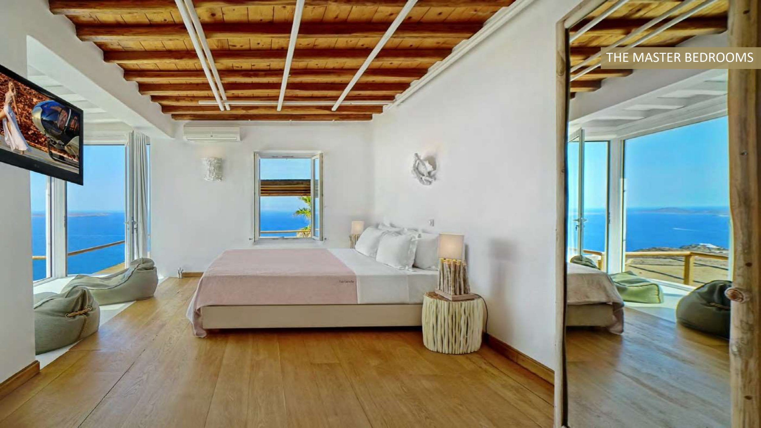
THE MASTER BEDROOMS