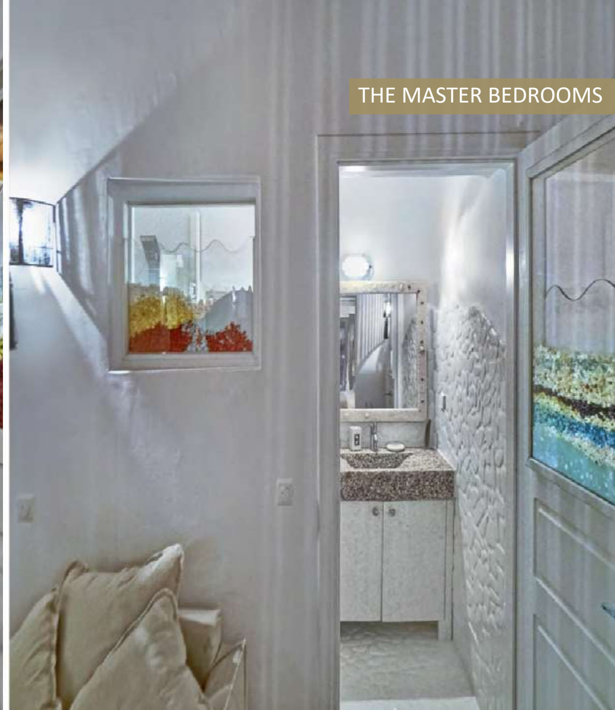
THE MASTER BEDROOMS