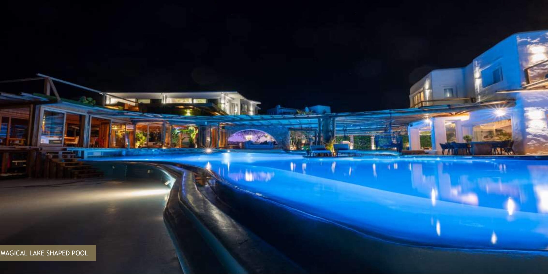
MAGICAL LAKE SHAPED POOL